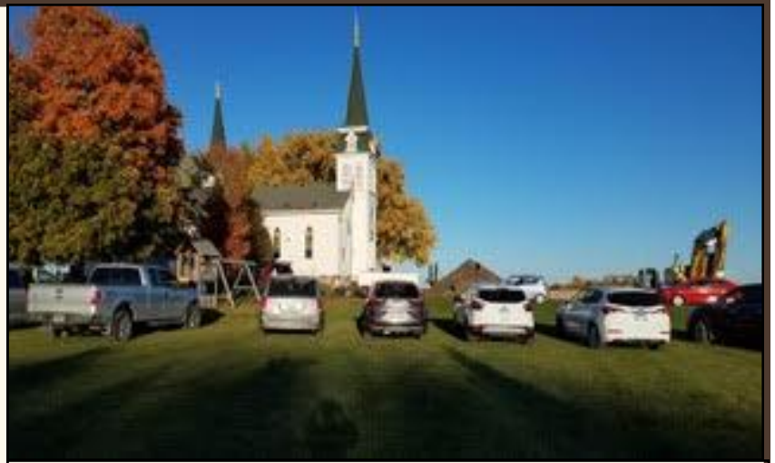
Saturday, October 10th: This afternoon's parking lot in our west "Field of Dreams" - looking east toward the church.