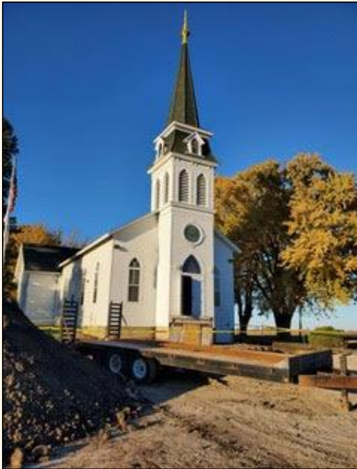
A view of our construction work from the south of the church.