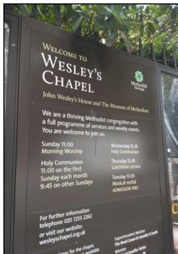
Day 3 of