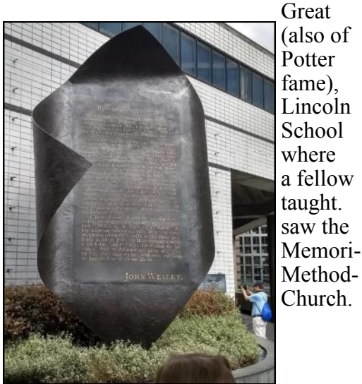
Great (also of Potter fame), Lincoln School where a fellow taught. saw the Memori-Method-Church.

Day two of the Wesley Pilgrimage was at Oxford University where both John and Charles Wesley were educated and where the Methodist movement began to take shape. We visited Christ Church Cathedral/Chapel, it's