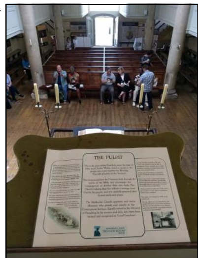
was also ley